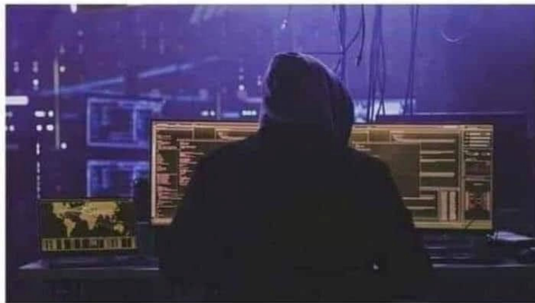
How people think they get hacked